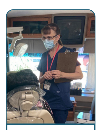
Expand services offered at Care & Connect clinics. Include medical and mental health screenings.