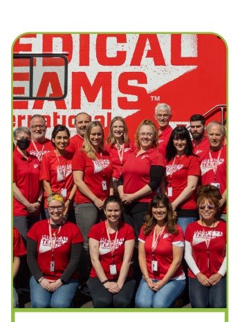
Build effective leadership and staff capacity. Expand training and education for staff.